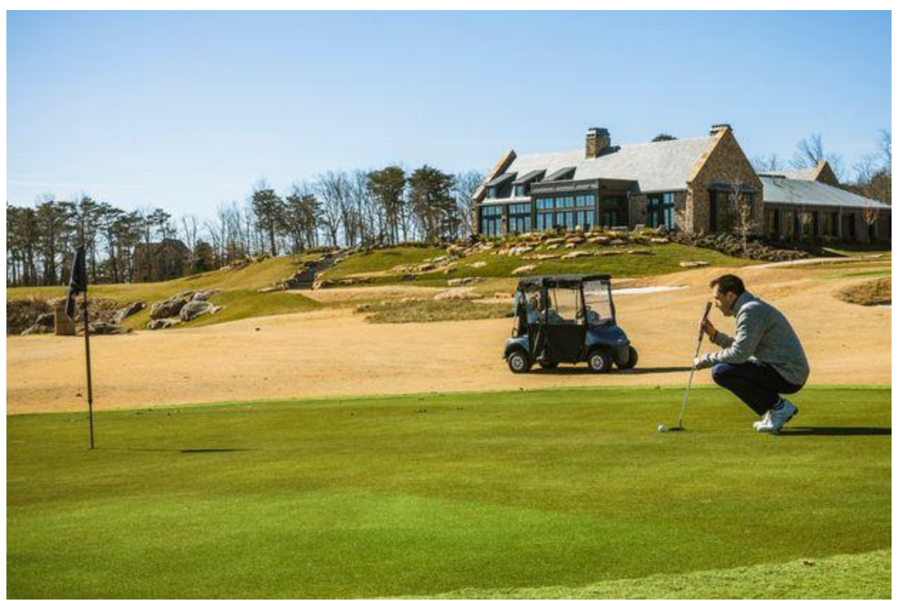
The Cairn 6-hole short course at McLemore in Rising Fawn, Ga. entices golfers in who prefer to make their winter rounds short and sweet.

Golf's inherently socially distanced nature is fueling its surge in popularity. Total rounds played in the U.S. in 2020 were up 37% in December year over year, according to the research firm Golf Datatech.