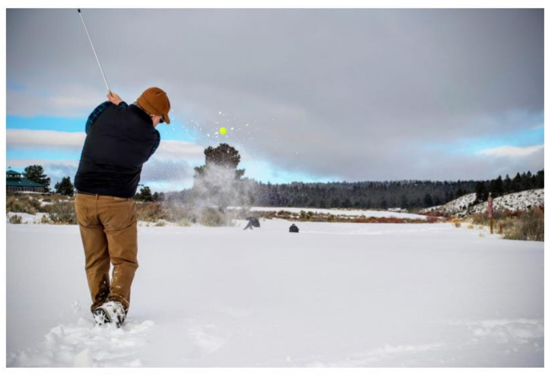
WINTER GAMES A blustery swing at Silvies Valley Ranch in Seneca, Ore.