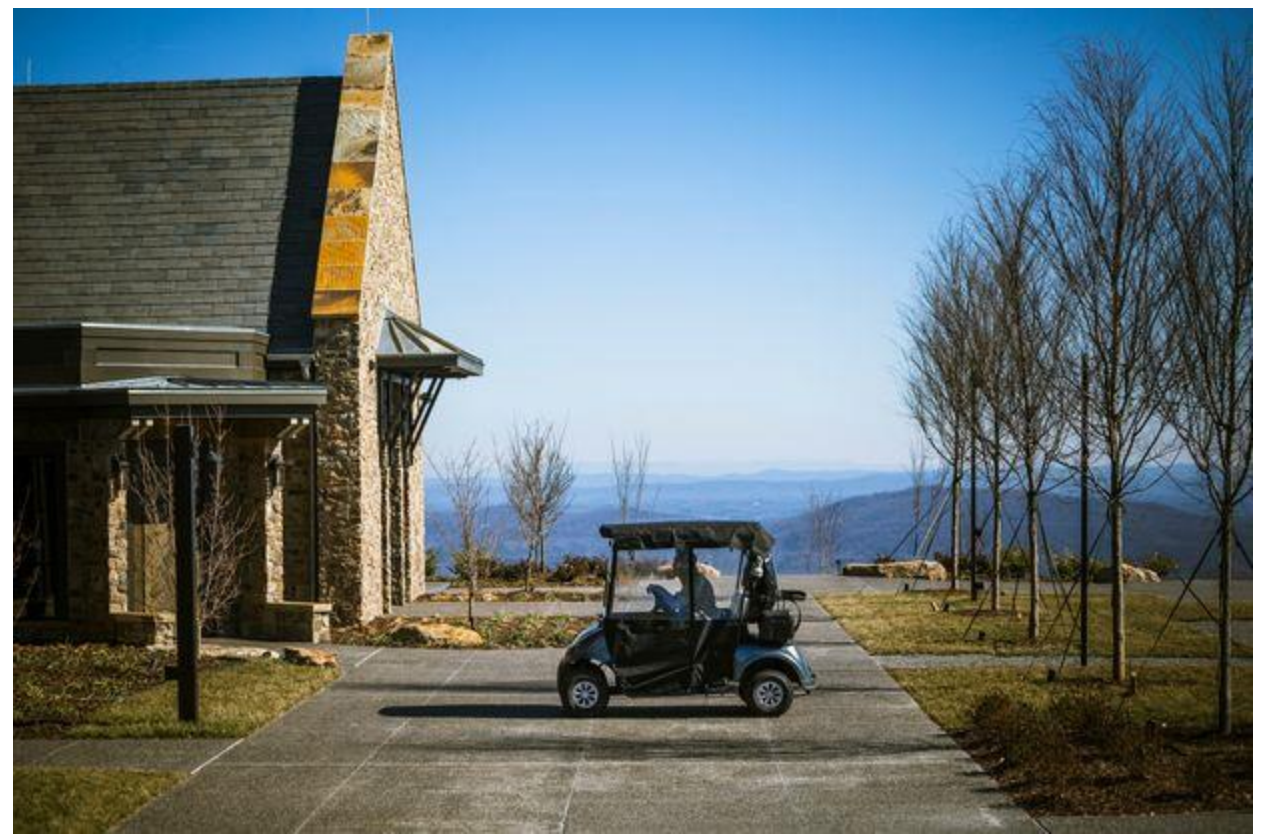
Georgia's McLemore golf club has put propane heaters in the carts.

cups, introducing a new kind of putting challenge. Winter bookings at the Ranch are up more than 200% from last year.