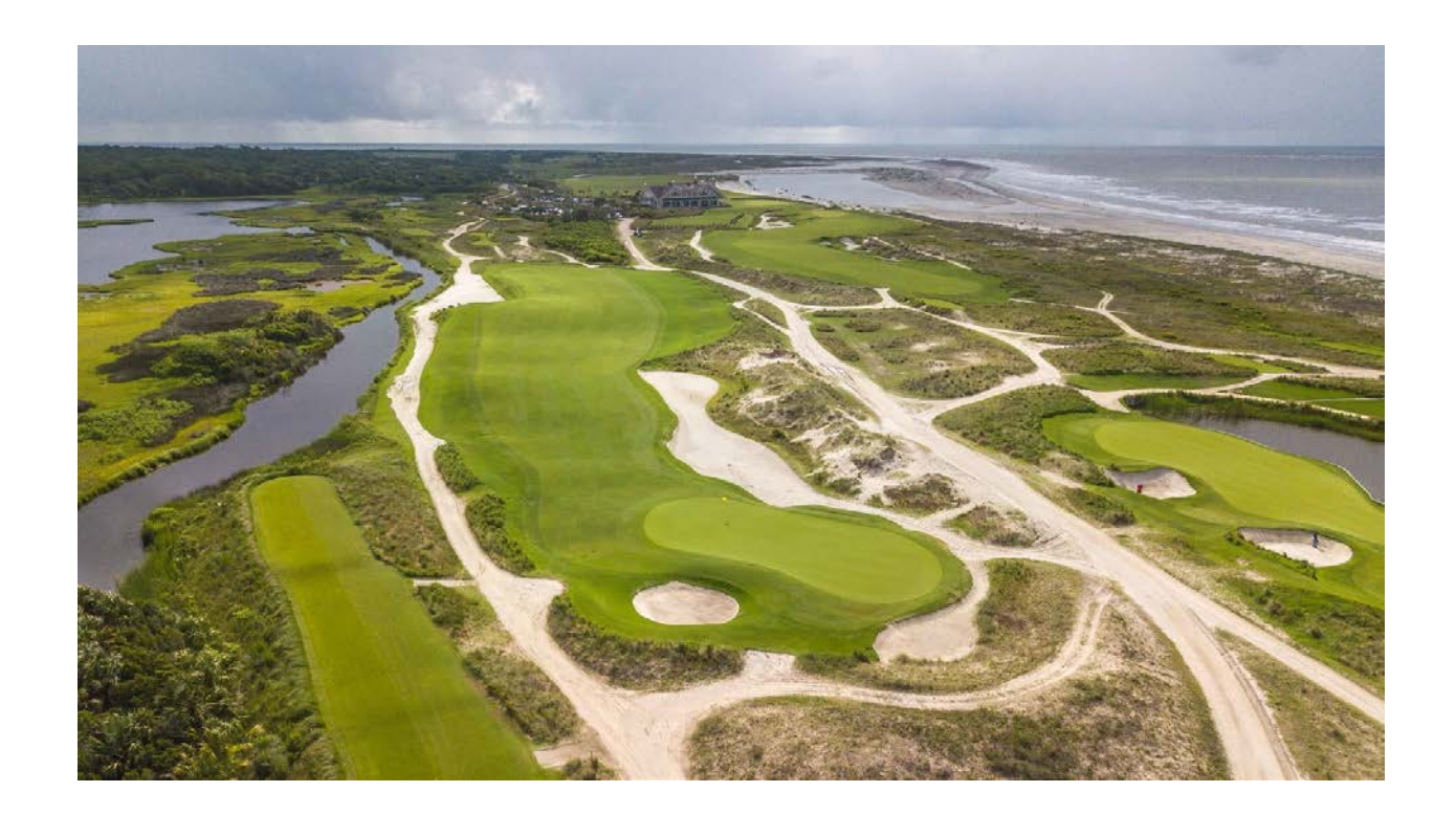
Kiawah Island's Ocean Course.