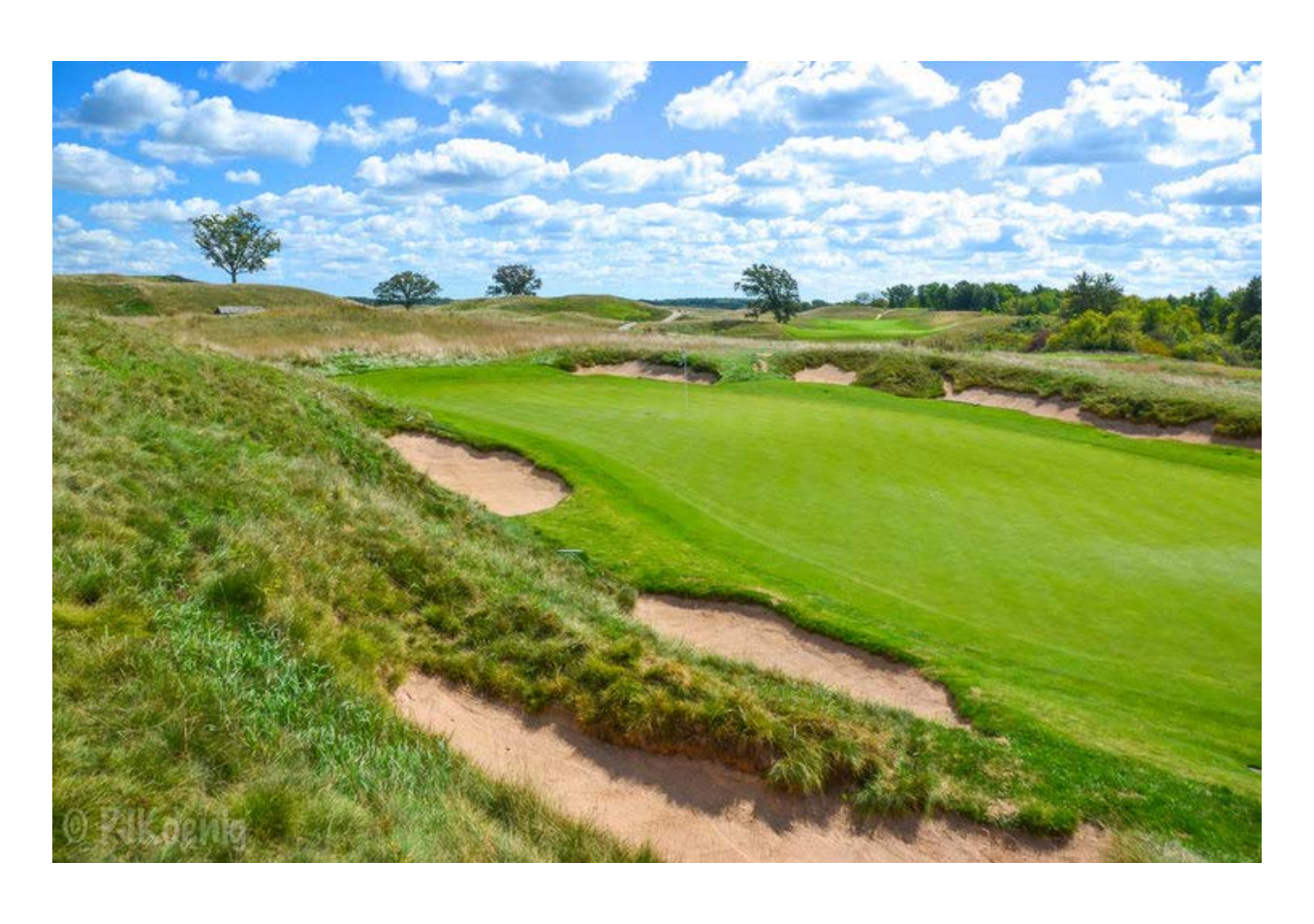
The 16th hole at Erin Hills