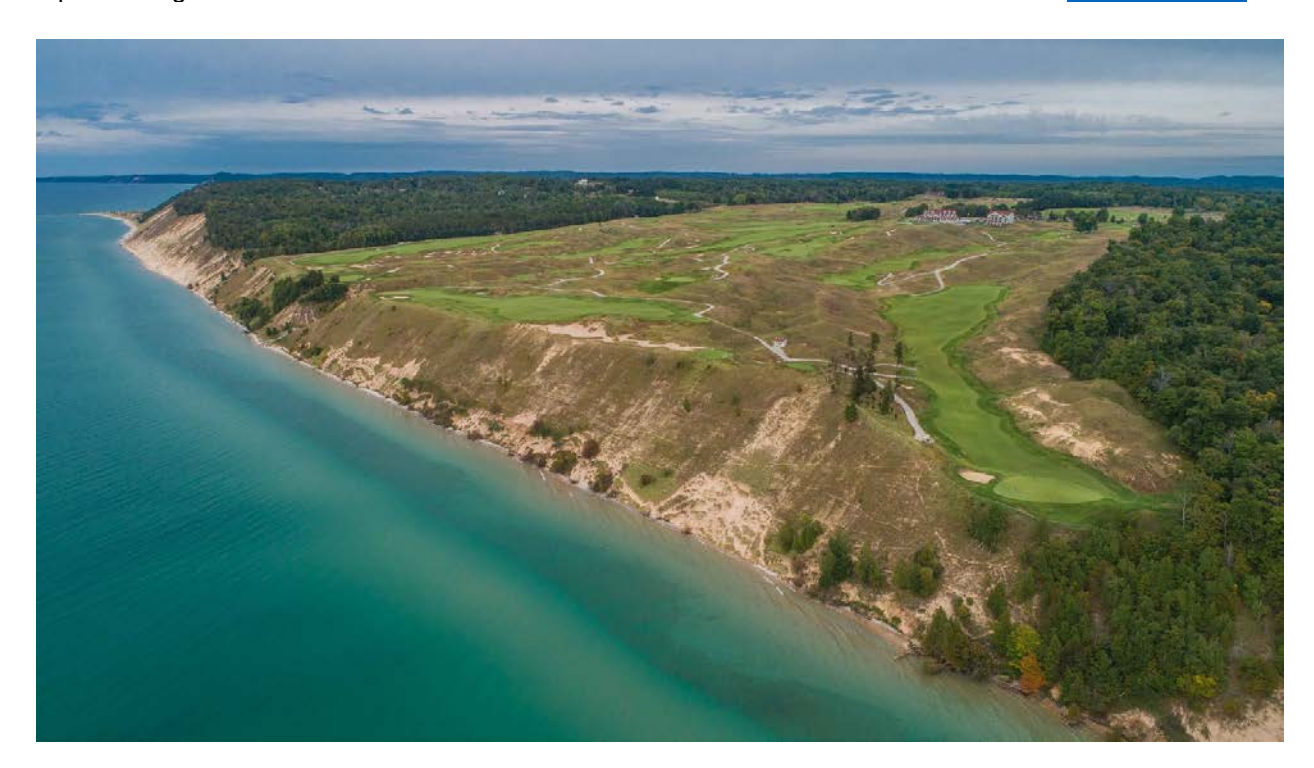
The aptly named Arcadia Bluffs in Michigan.

Depending on how you set up the trip, there can be a decent amount of traveling involved on a buddies trip to Michigan. I scoured the entire state over two weeks on the RGV Tour. Check out the recap here.