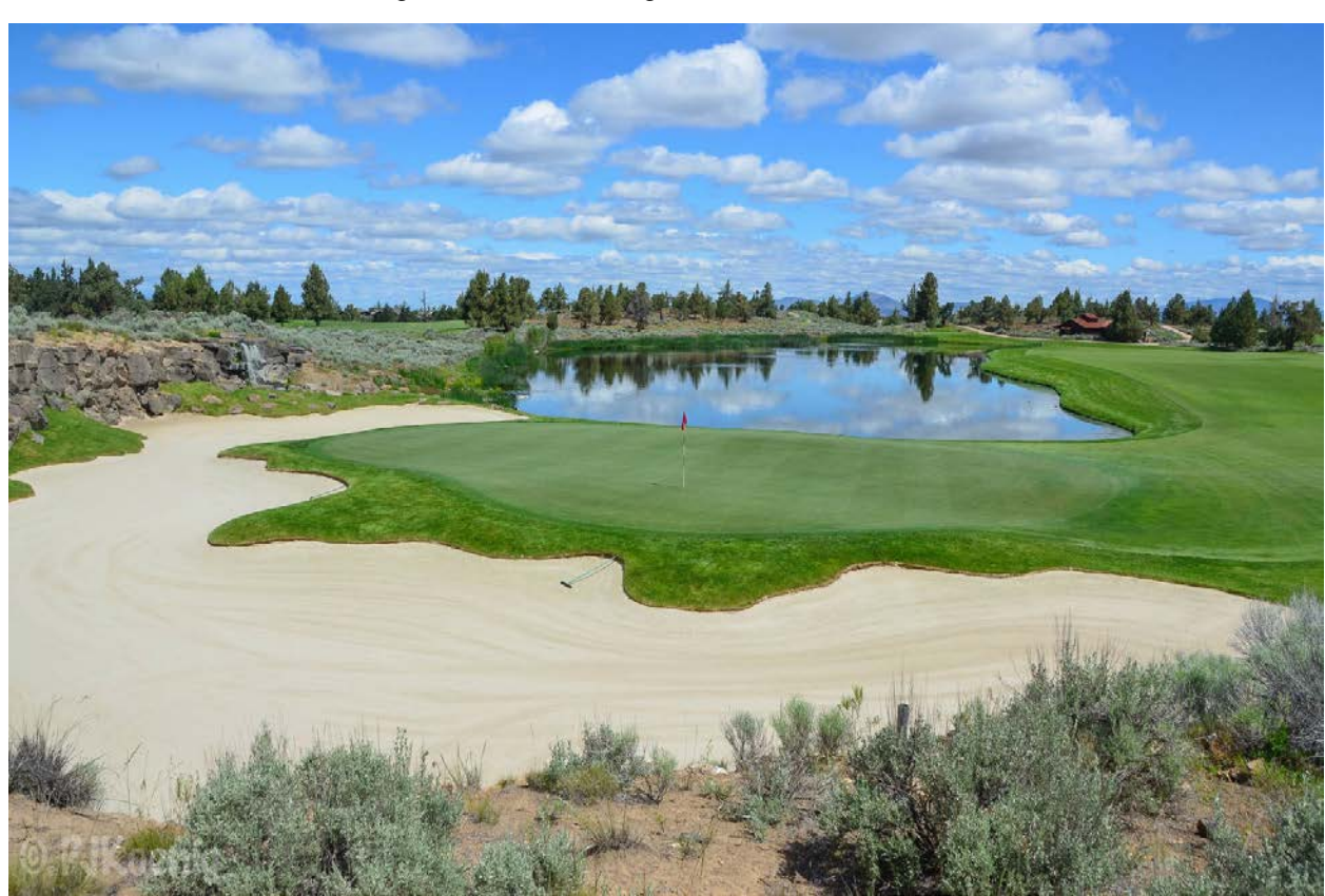
The Nicklaus Course at Pronghorn.

You can view the full list of Oregon courses here. I got em all covered.