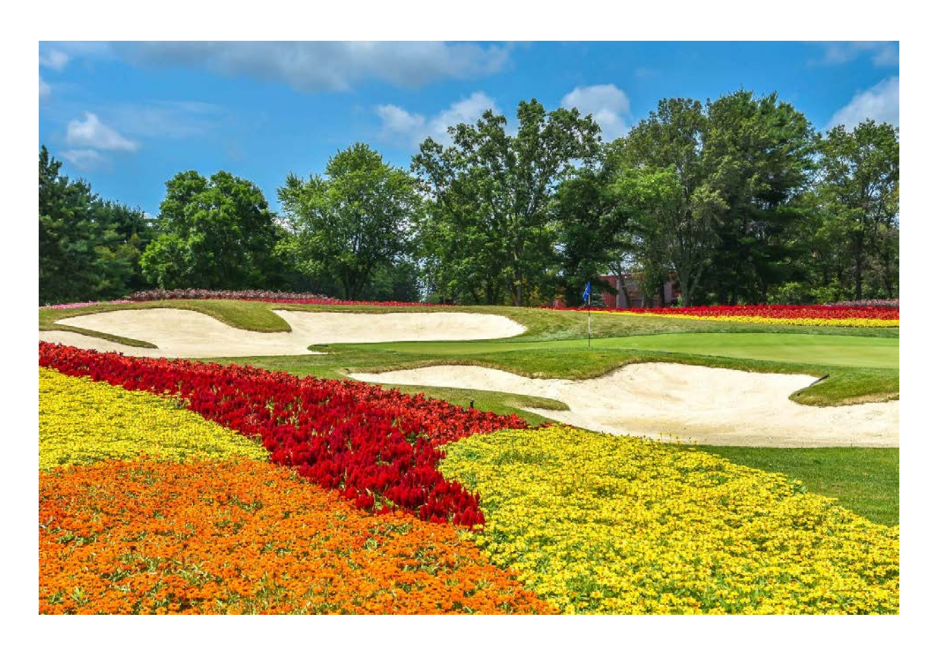
The flower hole at Sentry World features a new floral design each year.