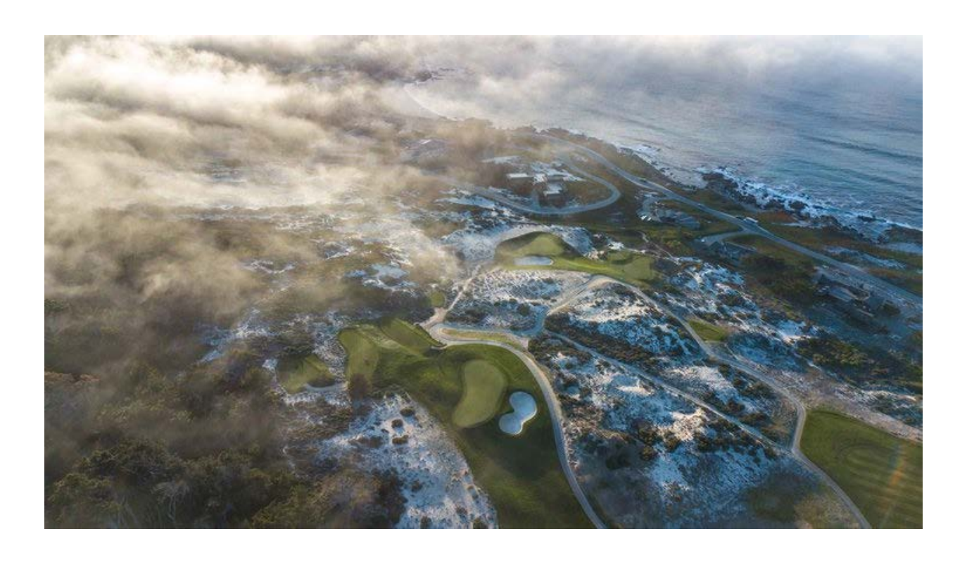
The 2nd and 3rd holes at Spyglass Hill