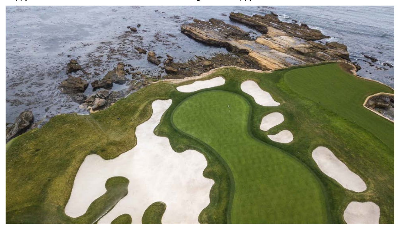
The 17th at Pebble Beach Golf Links