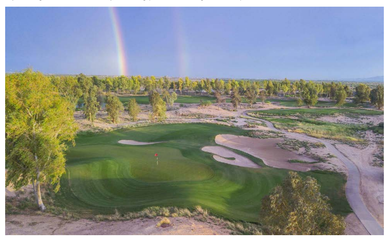
A double rainbow over the 11th hole at Southern Dunes