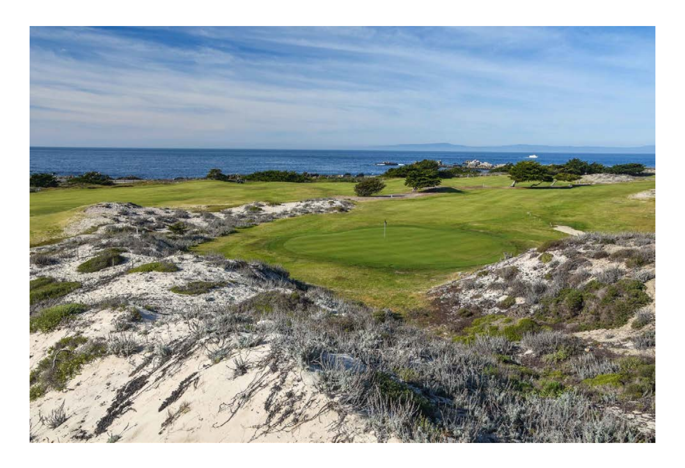
Pacific Grove Golf Links is on my list of must plays in Monterey.