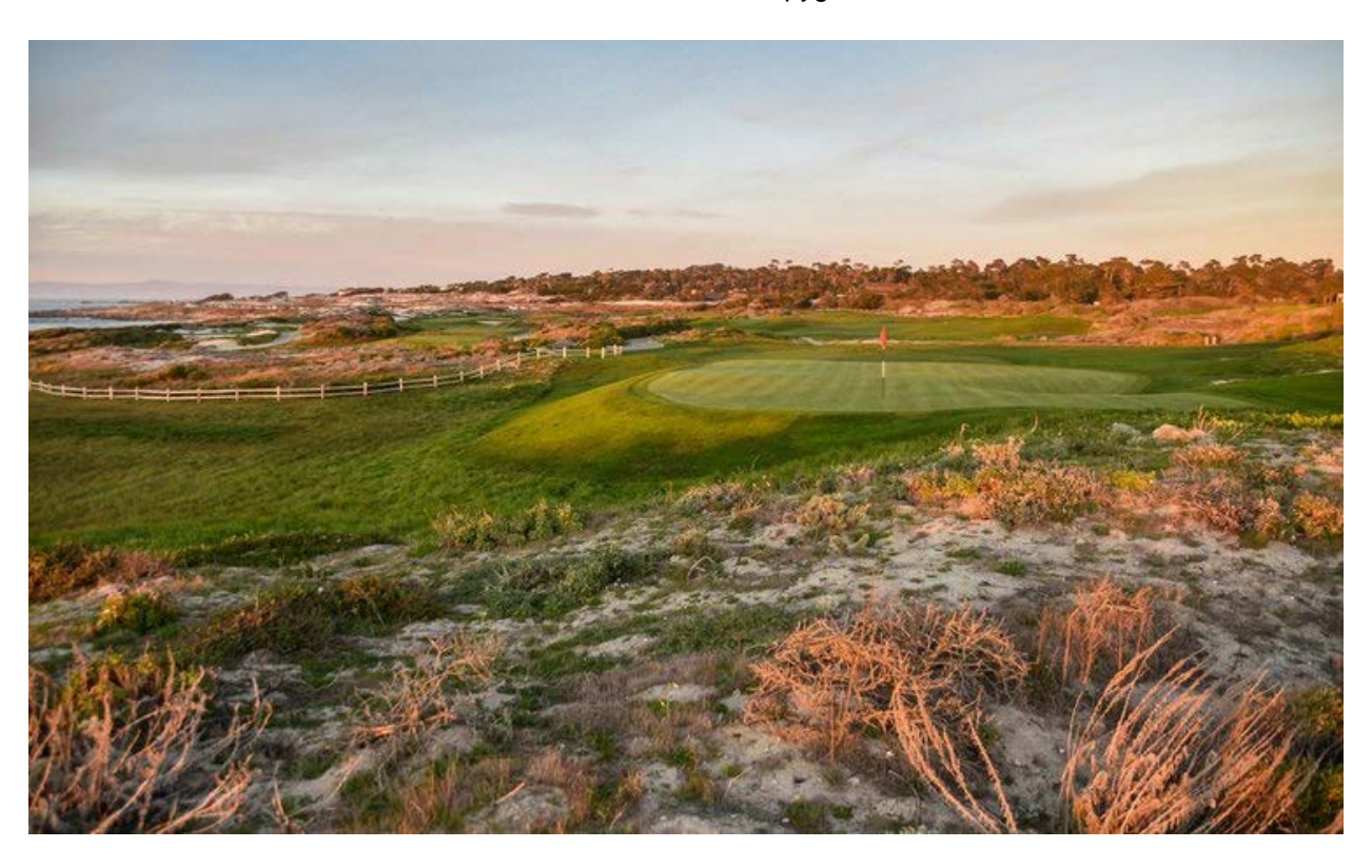
The 14th hole at Spanish Bay