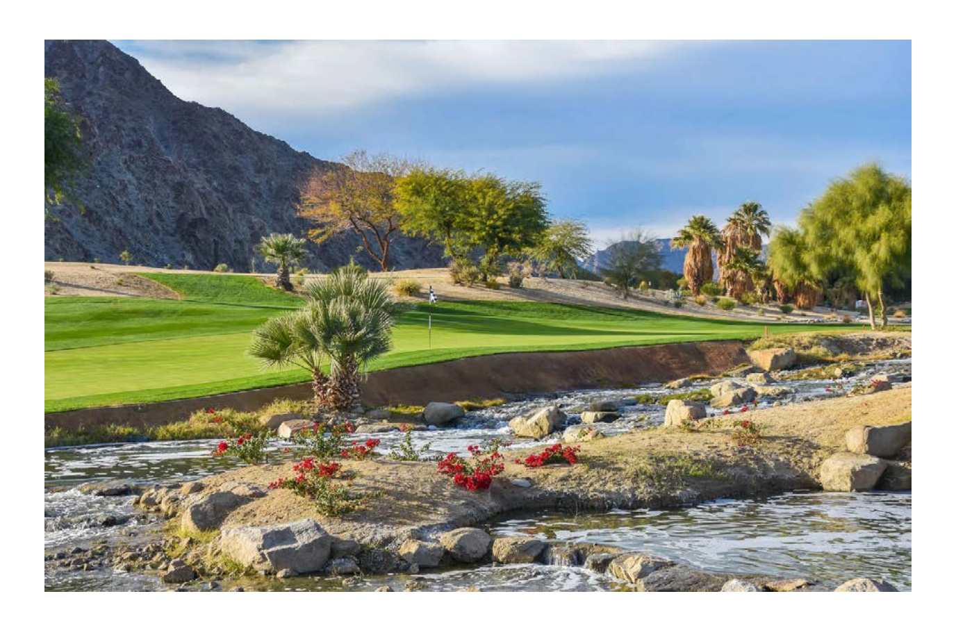
Silver Rock is one of my favorite picks for Palm Springs golf.