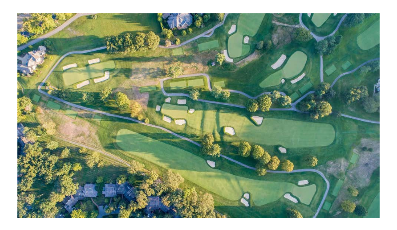
The Old White TPC course at The Greenbrier.