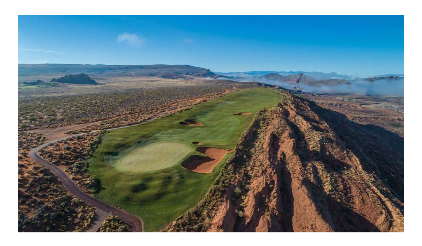
The 14th hole at Sand Hollow