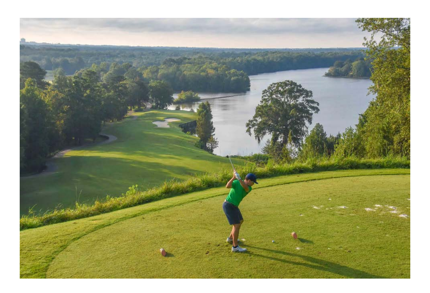
The opening hole on Capitol Hill's Judge course. One of my RTJ favorites.