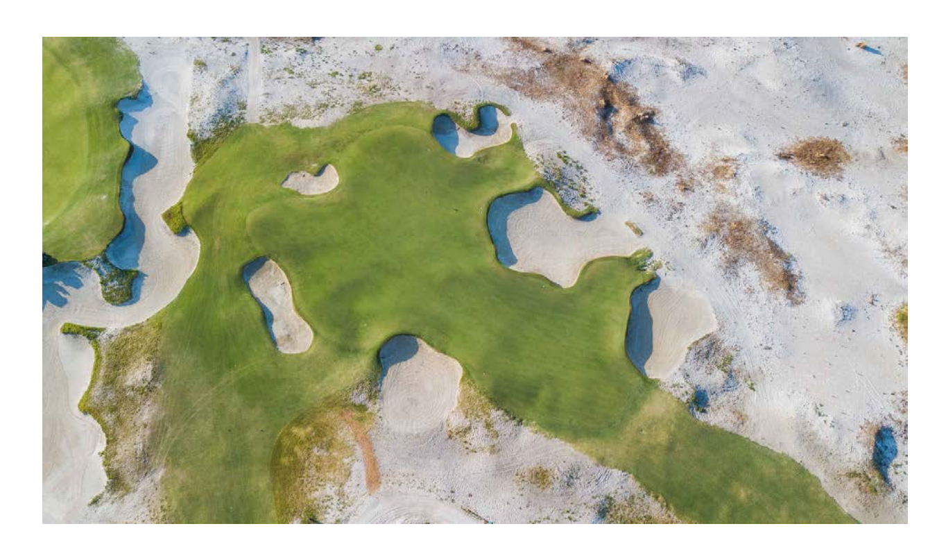
Gil Hanse's Black course at Streamsong