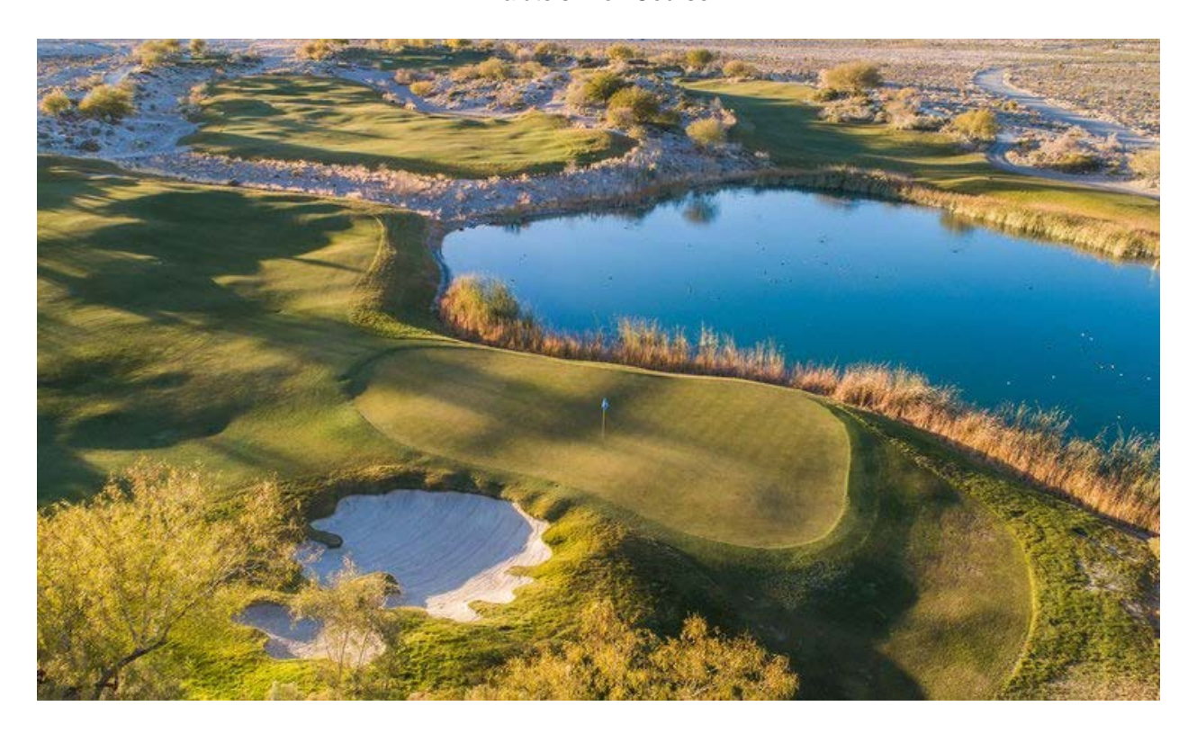
Nicklaus' Coyote Springs