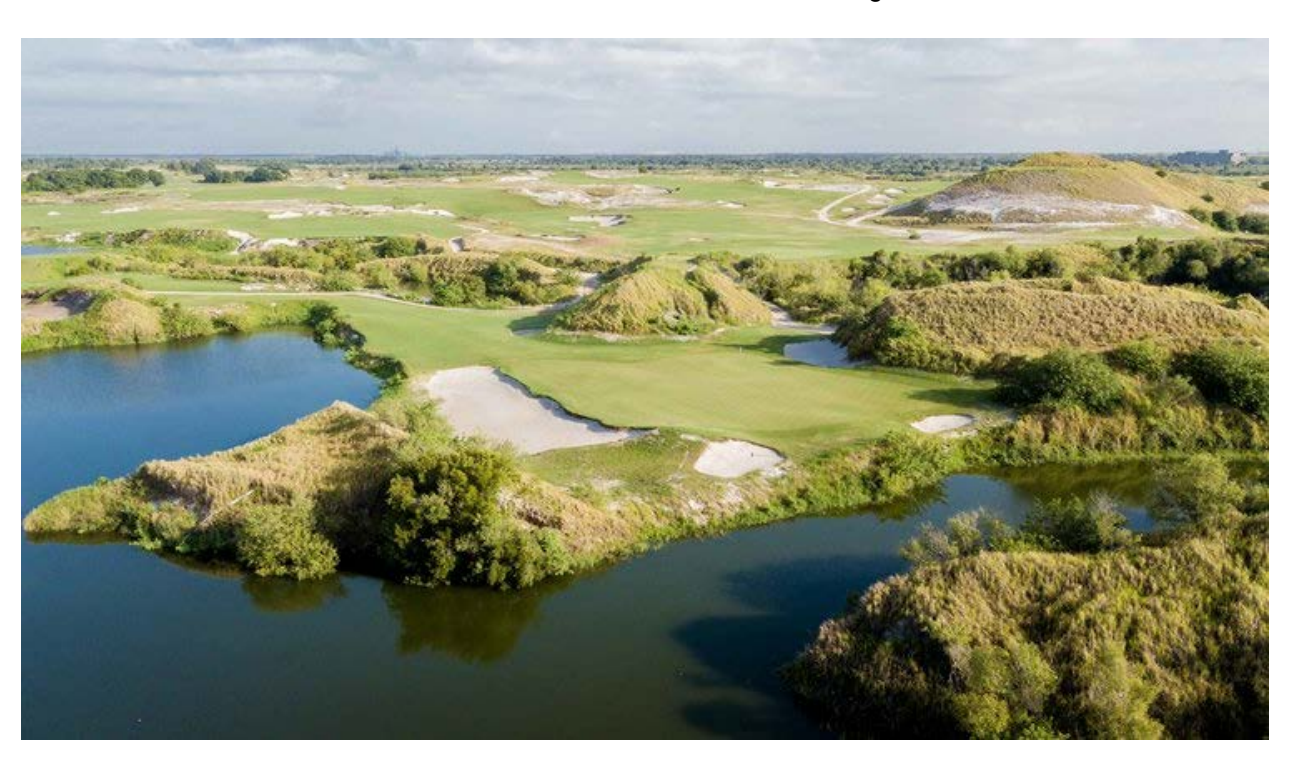
The red course shines.