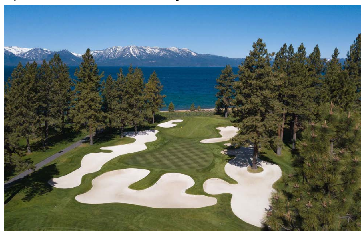
The 16th hole at Edgewood Tahoe