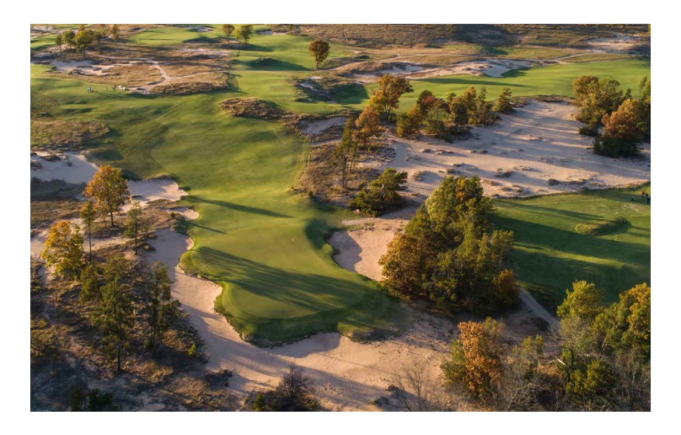
Coore and Crenshaw's Sand Valley