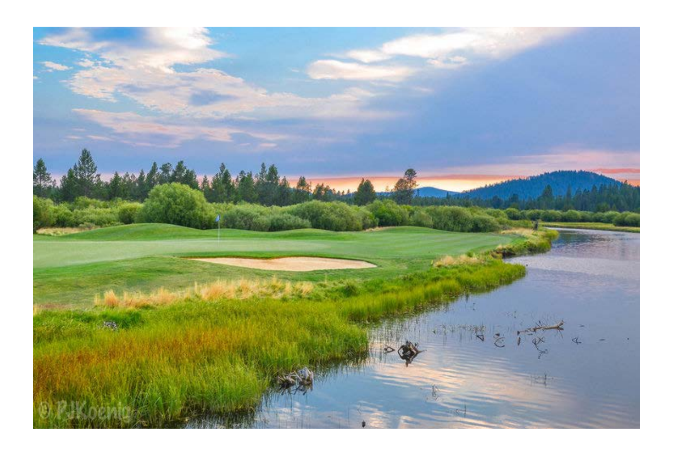
The finishing hole at Crosswater.