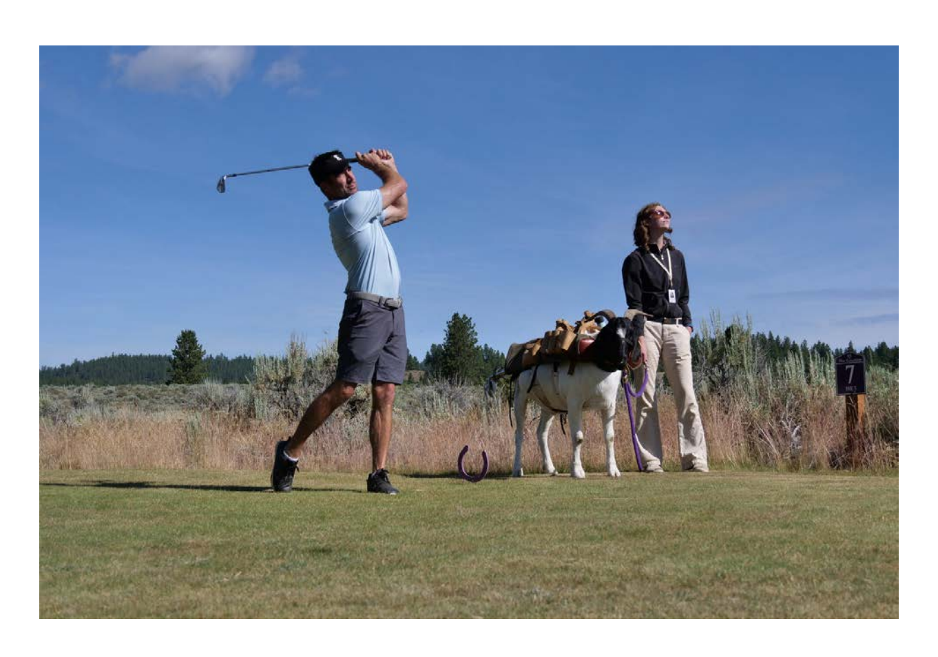
Bruce the goat caddy eyes and assesses the golf action.