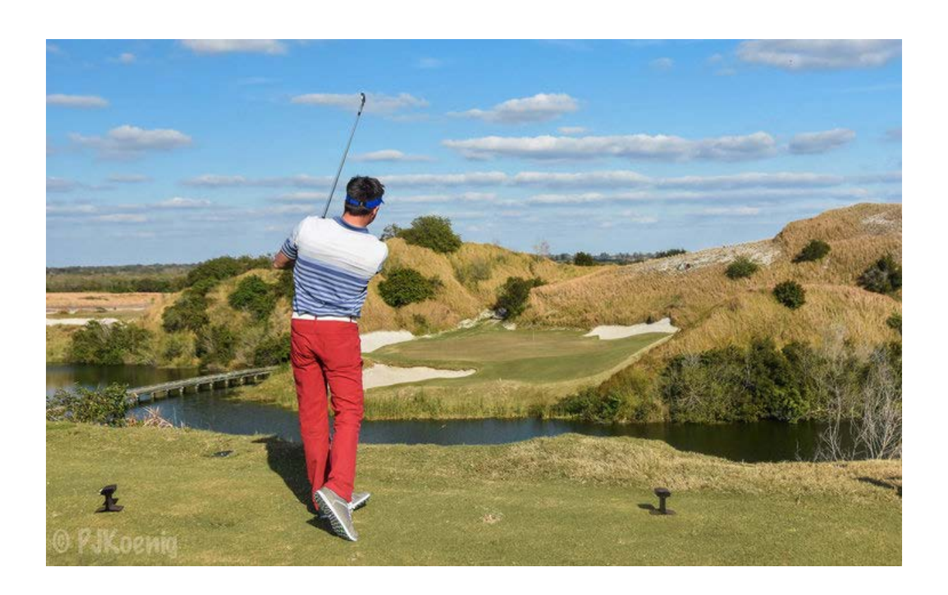
The Blue course's signature 7th hole.