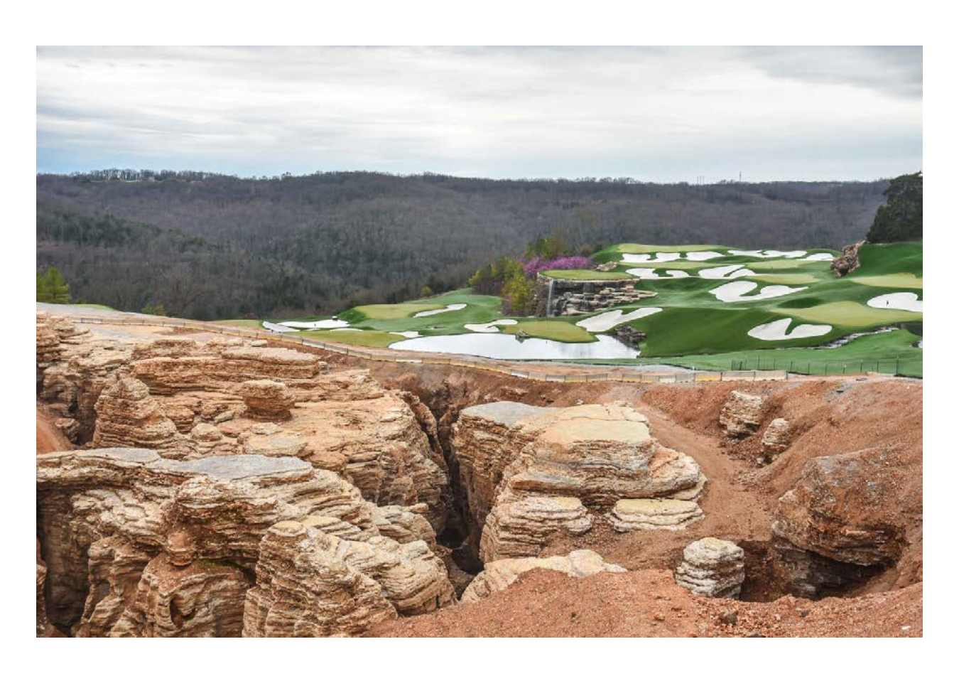
A giant sinkhole has been excavated in front of the range at The Top of The Rock.